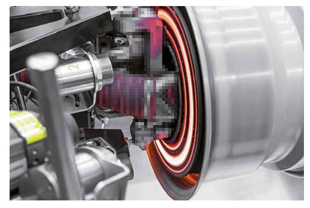
Video-captured brake event